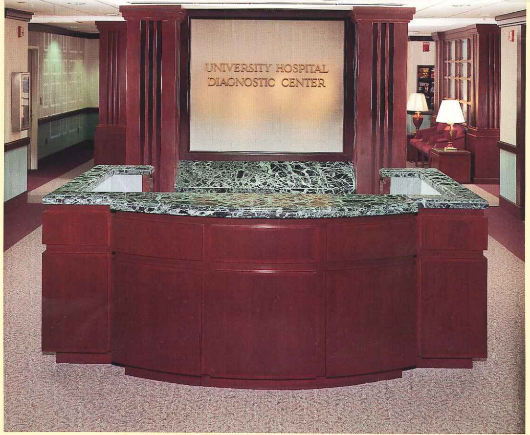
▲ University Hospital Diagnostic Center, Cincinnati Mahogany Reception Desk, mahogany fluted columns & Verdi marble.