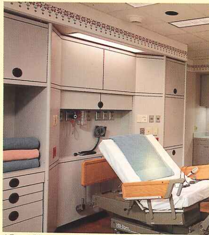
▲ Berry Women's Health Pavilion, Dayton Custom plastic laminate head wall & wardrobe units with retractable doors. Corian wash sink and post formed edges.

Many manufacturers have called upon Bruewer to make integrated customized parts from wood or plastic laminates. Some only need hundreds, while others have ordered thousands of units. These customers represent a broad base of American businesses from automotive to furniture to industrial. Send us your specs and we will be happy to give you a competitive estimate.