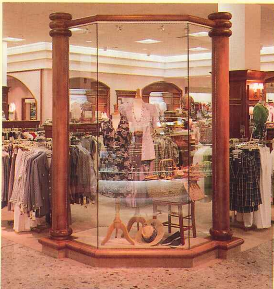
▲ McAlpin's Kenwood Corner column platform birch & maple with glass & lighting fixtures.