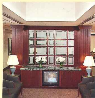
▲ University Hospital Diagnostic Center Mahogany window wall with inlaid frosted glass.