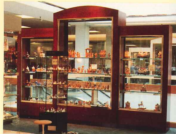
▲ Loose fixtures Two-Sided Maple & Glass floor display.