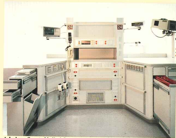
▲ Jackson County Medical Center ICU Plastic laminate cockpit style headwall.