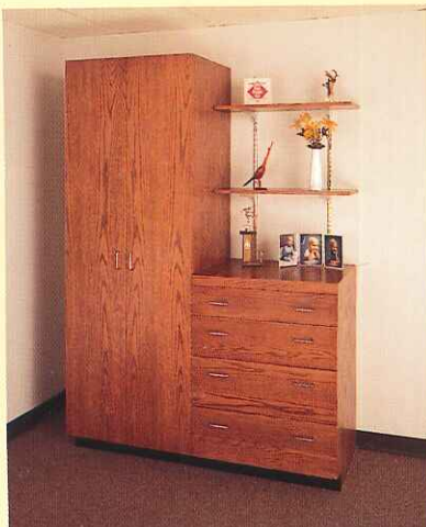
▲ Robin Run Village, Indianapolis Red oak wardrobe with matching chest of drawers and adjustable shelving.