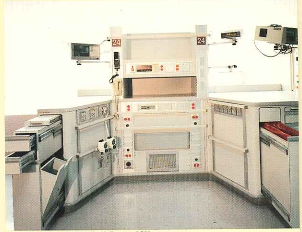
▲ Jackson County Medical Center ICU Plastic laminate cockpit style headwall.