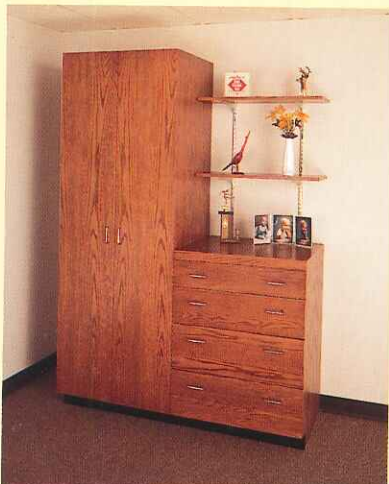
◀ Robin Run Village, Indianapolis Red oak wardrobe with matching chest of drawers and adjustable shelving.