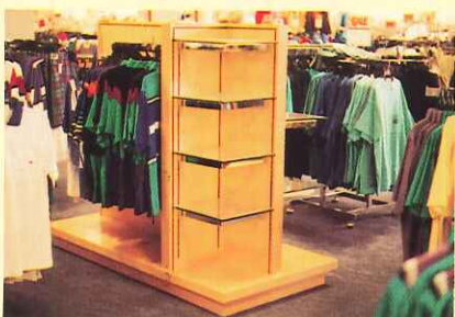
▲ Loose fixtures Maple & glass with adjustable shelving, custom chrome hang bars.