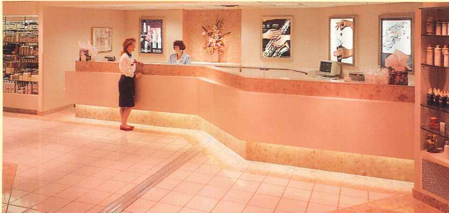
▲ McAlpin's Eastgate Beauty salon reception counter, plastic laminate & marble.