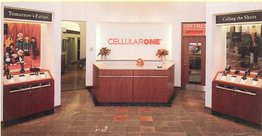
◀ Cellular One Reception counter & displays-solid surface & laminates.