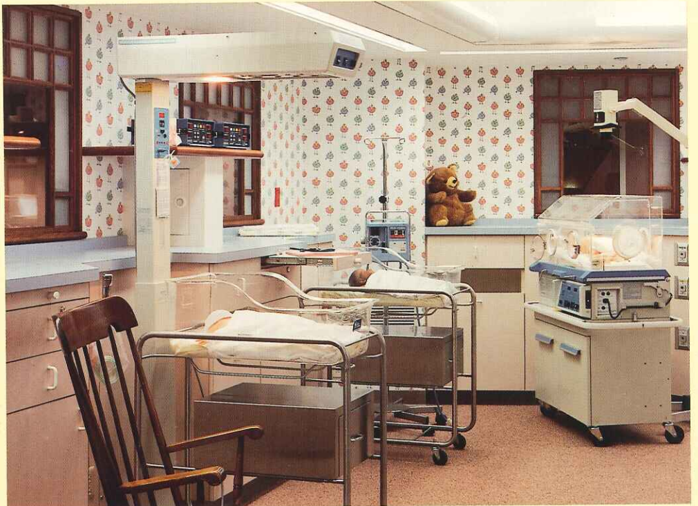
▲ Bethesda NICU Custom plastic laminate headwalls with custom red oak and frosted glass windows.