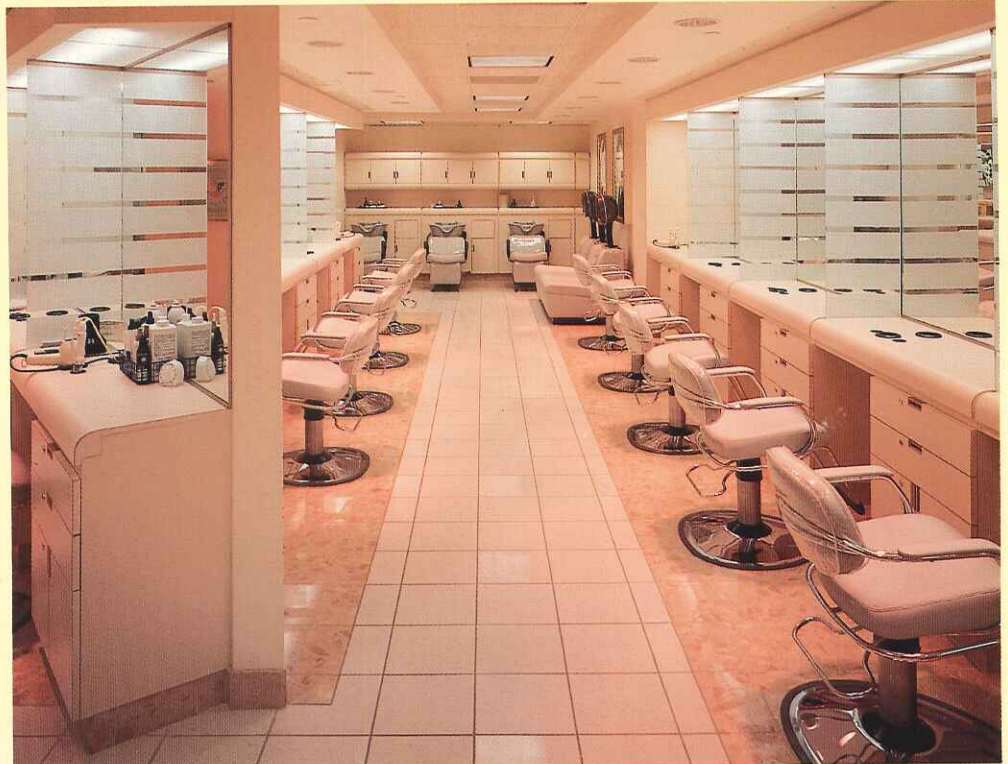
McAlpin's Eastgate▲ Beauty salon styling and wash stations.