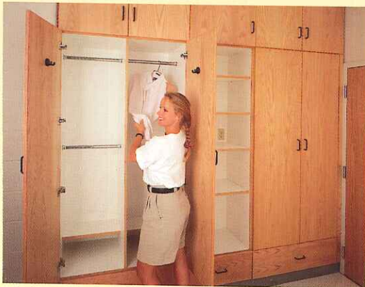
▲ Xavier University Residence Hall, Cincinnati Plain sliced oak facing and white melamine adjustable shelving. Inside of doors are rotary cut red oak. European concealed hinges.