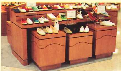
▲ Loose fixtures Maple shoe display cubes.