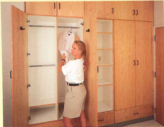
▲ Xavier University Residence Hall, Cincinnati Plain sliced oak facing and white melamine adjustable shelving. Inside of doors are rotary cut red oak. European concealed hinges.