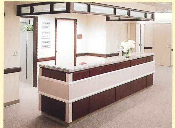
▲ University Hospital Diagnostic Center, Cincinnati Mahogany nurses' station with Corian corner guard & fascia. Top Verdi marble. Mahogany soffit with frosted glass.