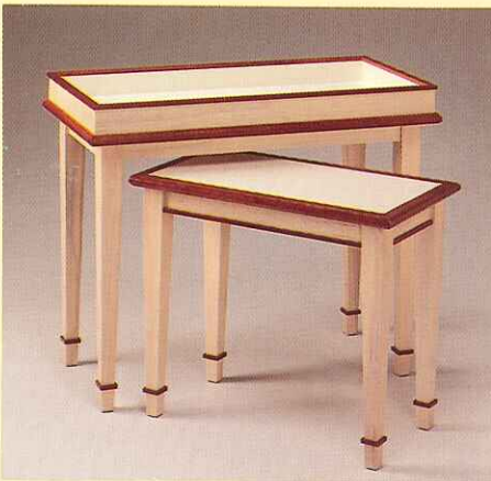
▲ Loose fixtures Nesting parson tables. Ash with plastic laminate top. Reversible top is either flush or a 4" rim table.