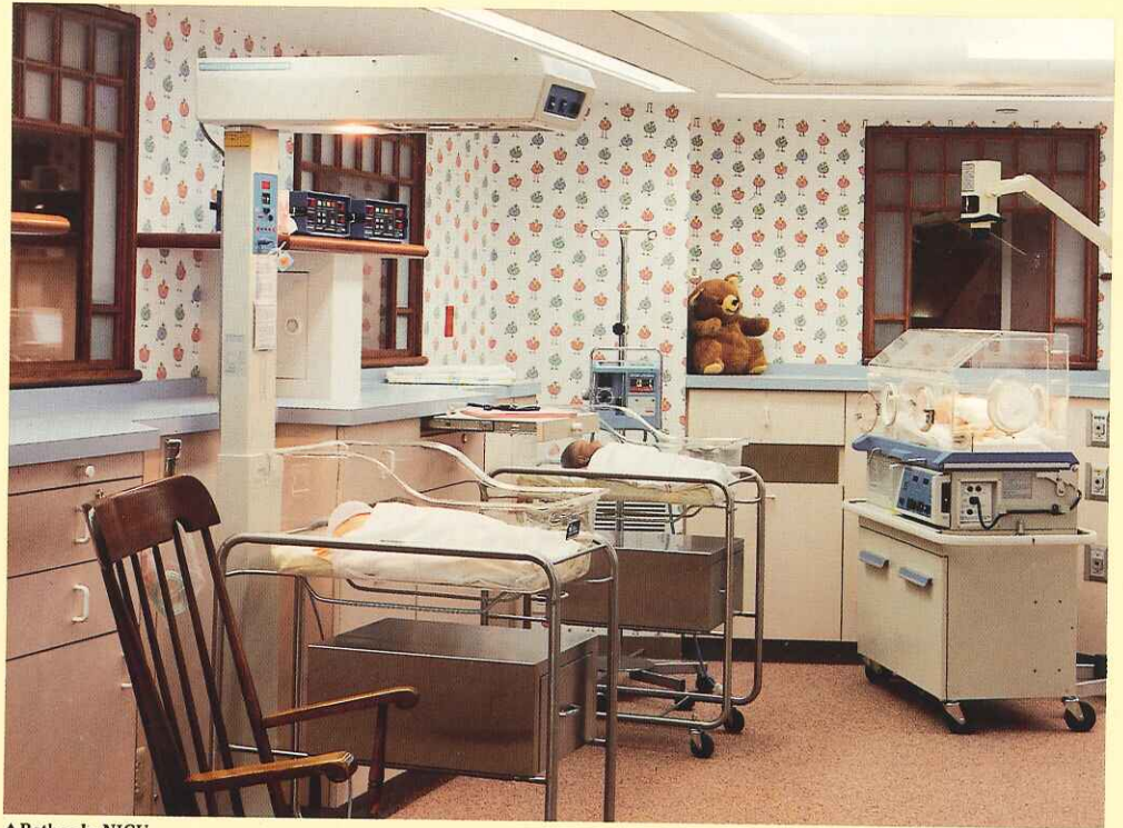
▲ Bethesda NICU Custom plastic laminate head walls with custom red oak and frosted glass windows.