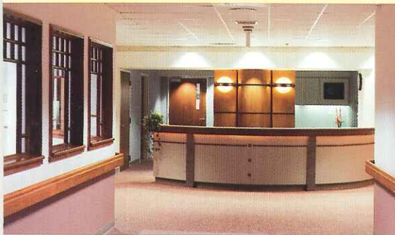
▲ Bethesda Oak Hospital Reception Counter to NICU. Plastic laminate with red oak inlay. Highly figured anigre columns, red oak windows and hand rail.