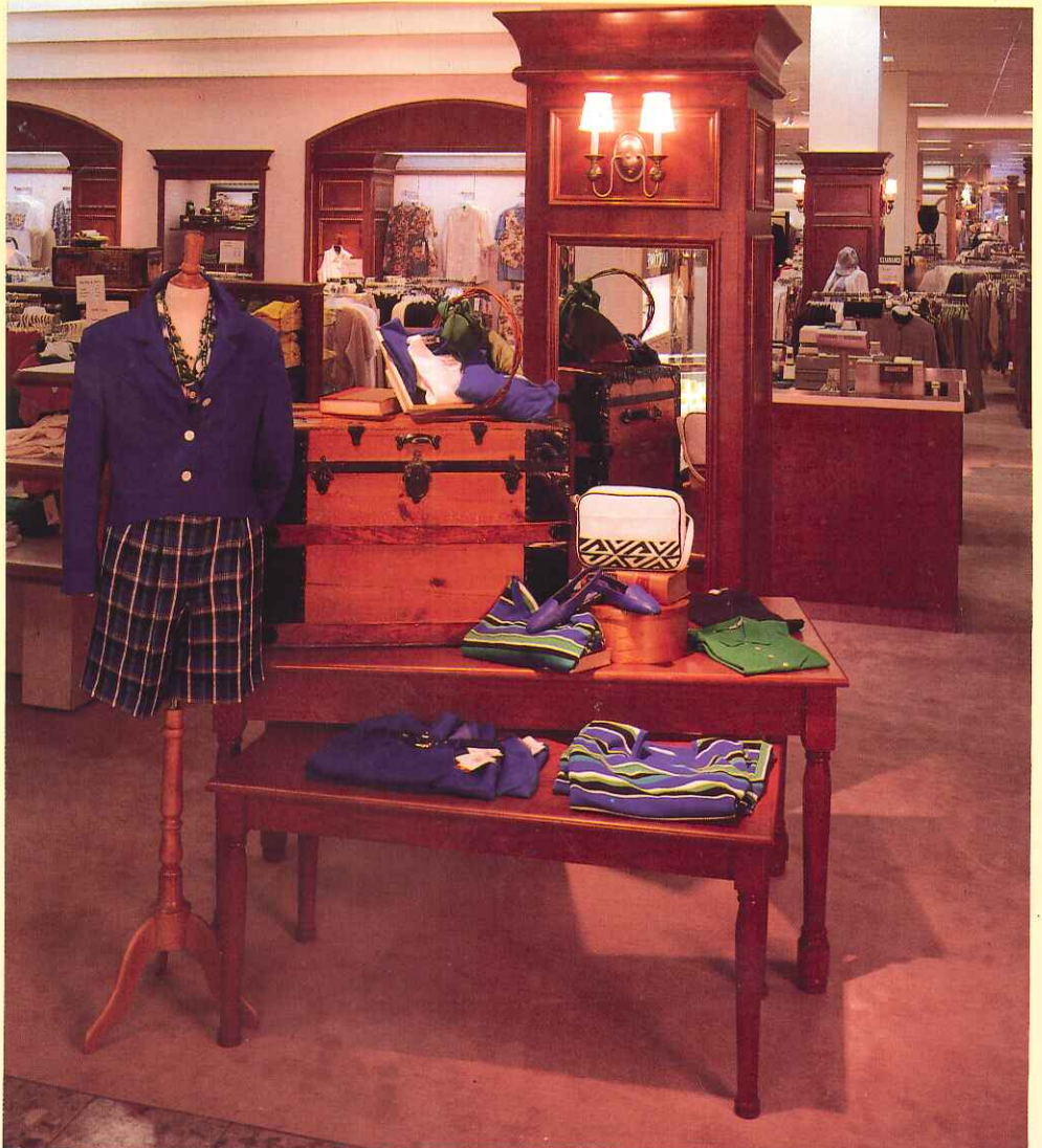
McAlpin's Kenwood Cherry wall & perimeter fixturing, nesting tables and cash wrap counter.