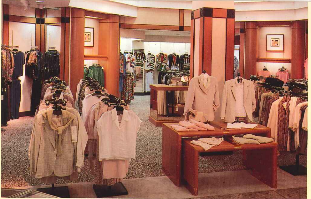
▲ McAlpin's Kenwood Men's Wear Department. Cash wrap counter, perimeter fixturing & nesting tables. Maple with ebonized poplar accents.