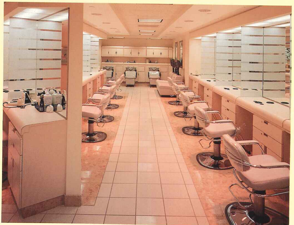
▲ McAlpin's Eastgate Beauty salon styling and wash stations.