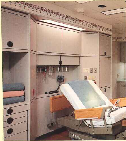
▲ Berry Women's Health Pavilion, Dayton Custom plastic laminate head wall & wardrobe units with retractable doors. Corian wash sink and post formed edges.

Many manufacturers have called upon Bruewer to make integrated customized parts from wood or plastic laminates. Some only need hundreds, while others have ordered thousands of units. These customers represent a broad base of American businesses from automotive to furniture to industrial. Send us your specs and we will be happy to give you a competitive estimate.