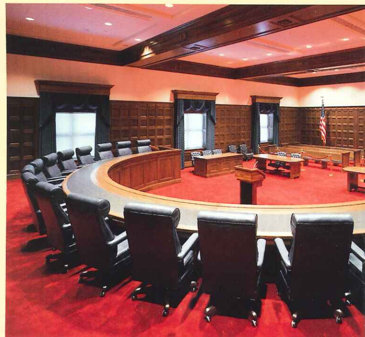
▲ Federal Appellate Courthouse, Cincinnati 38' diameter bulletproof walnut encased judges' bench. Plastic laminate inlay writing surface. Walnut attorneys' tables, spectator benches, wall panelling, valences and ceiling column enclosures.